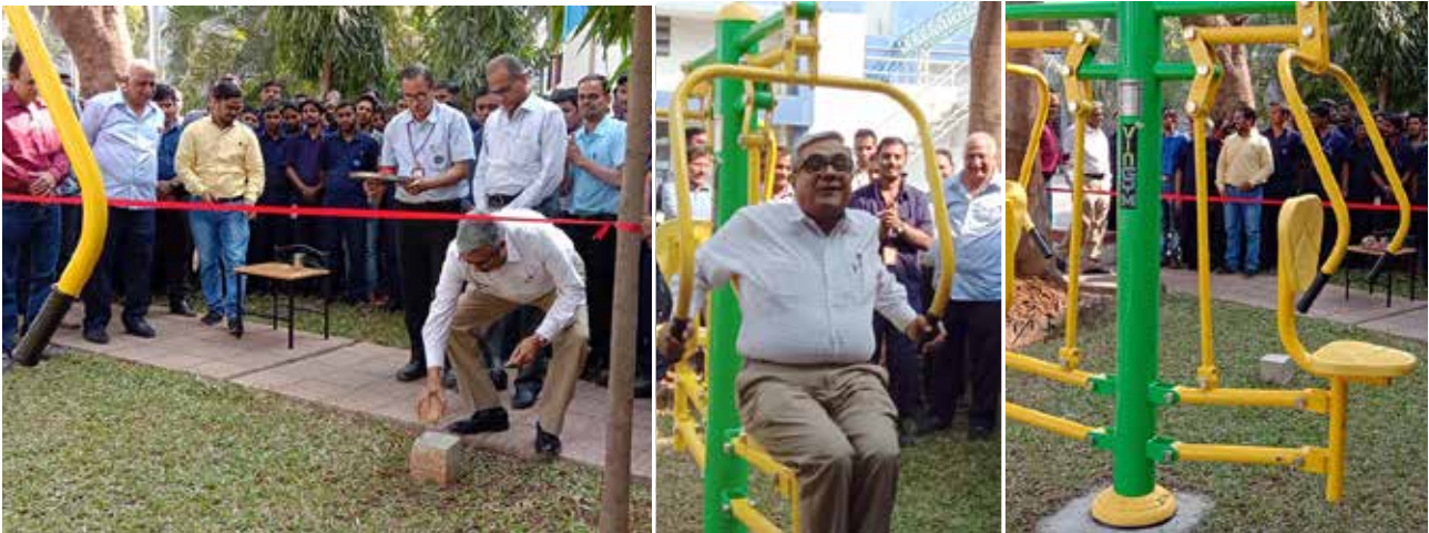
Fitness equipment inauguration by Shri Bipinbhai at Silvassa