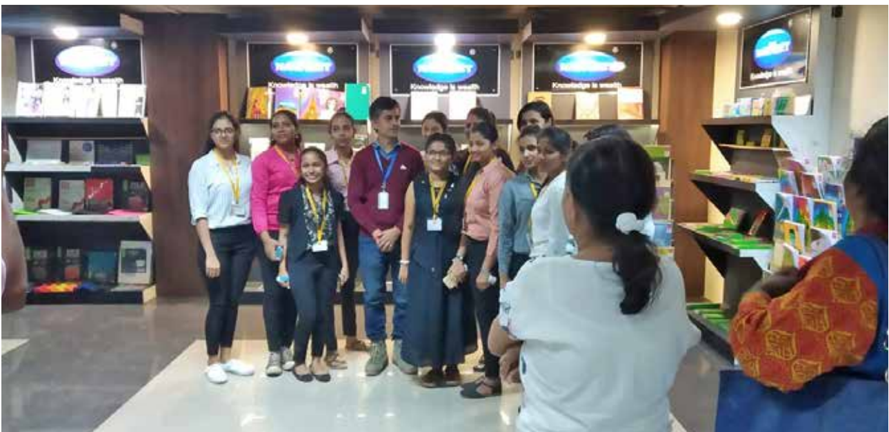
Niranjan Majithia College of Commerce. Kandivali